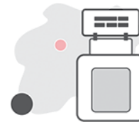
Multi parameter POC analyzers