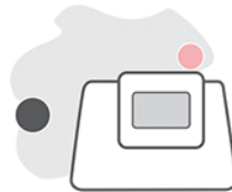
Single parameter POC analyzers