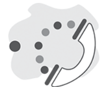
Nurse-patient communication systems