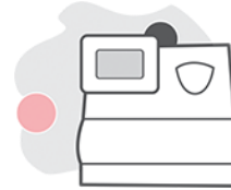
Cardiac markers analyzers, sepsis, pregnancy, coagulation