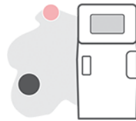
Blood gas and electrolyte analyzers